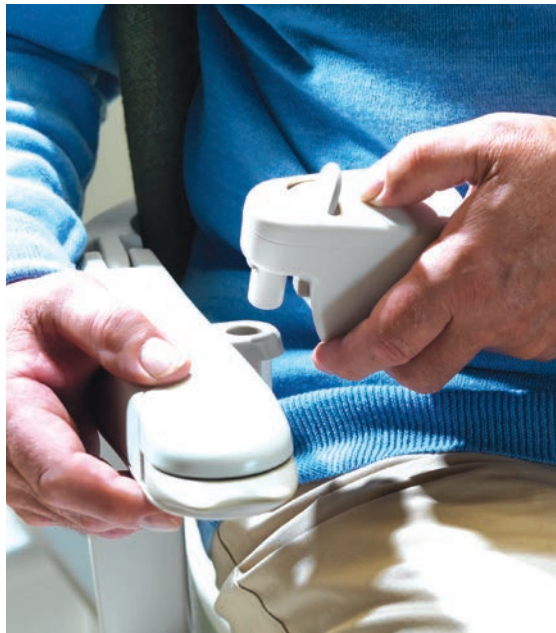
Seatbelt can be fastened with one hand

Effortless and simple. This sums up beautifully just how much thought and care we have designed into each and every function of our Starla stairlift. From the safe and easy-to-use seatbelts, to stairlifts that take up minimal space on your staircase, we have made your Starla stairlift simple, safe and reliable.