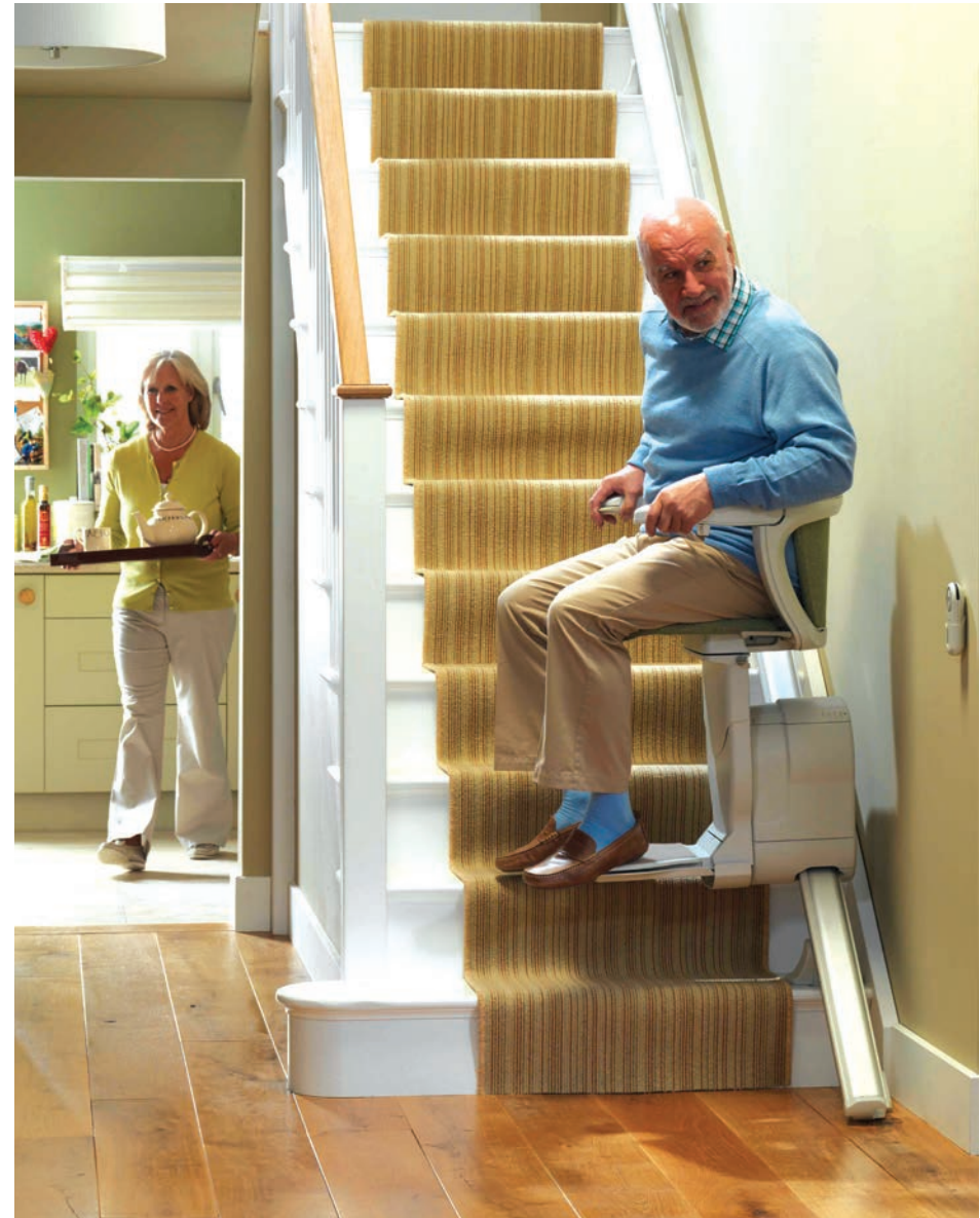
A gentle touch of the controls is all it takes to climb your stairs