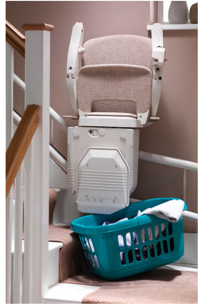
Sensors detect any obstructions on your stairs

"We are delighted with the stairlift. My wife enjoys the ride. It gives her independence. She finds it very easy to use"