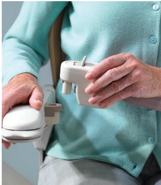
Seatbelt can be fastened with one hand

Effortless and simple. This sums up beautifully just how much thought and care we have designed into each and every function of our Starla stairlift. From the safe and easy-to-use seatbelts, to stairlifts that fit on either side of the stairs and on all types of staircases, we have made your Starla stairlift simple, safe and reliable.