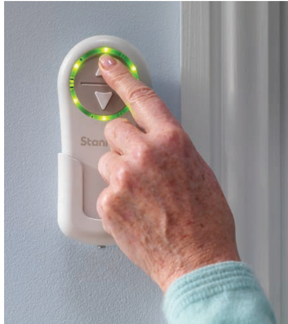
Use the wall control to call your Starla