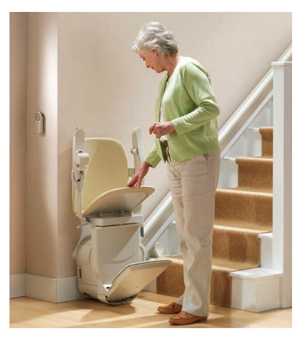
The Siena features a seat-to-footrest link