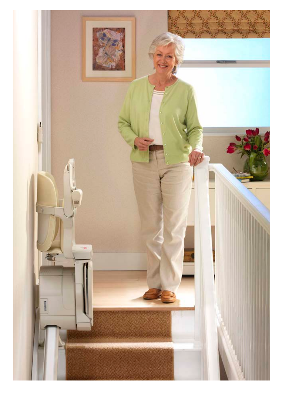
The Siena's slimline design allows others to still use the stairs

The Siena also comes in two chair widths allowing you to pick the one most comfortable for you, your home and your life.